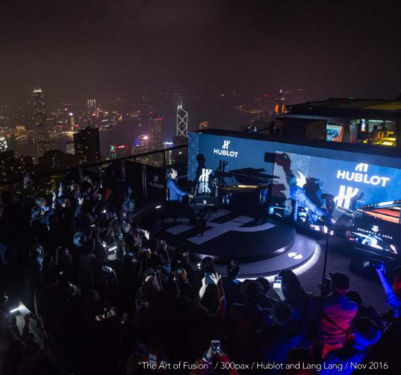
"The Art of Fusion" / 300pax / Hublot and Lang Lang / Nov 2016