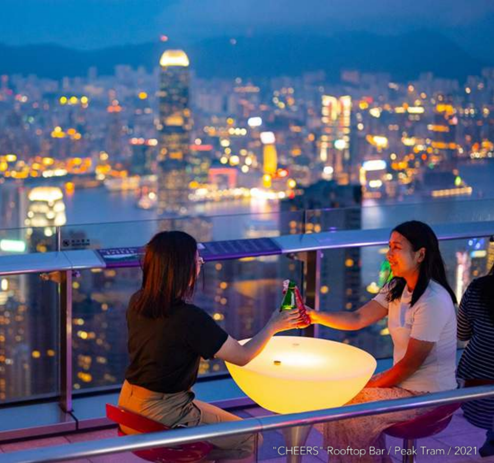
"CHEERS" Rooftop Bar / Peak Tram / 2021