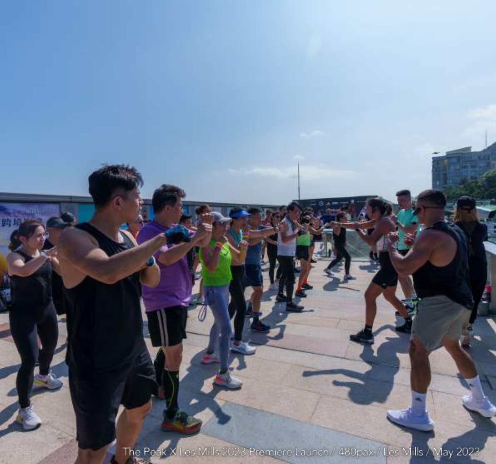
The Peak X Les Mills 2023 Premiere Launch / 480pax / Les Mills / May 2023