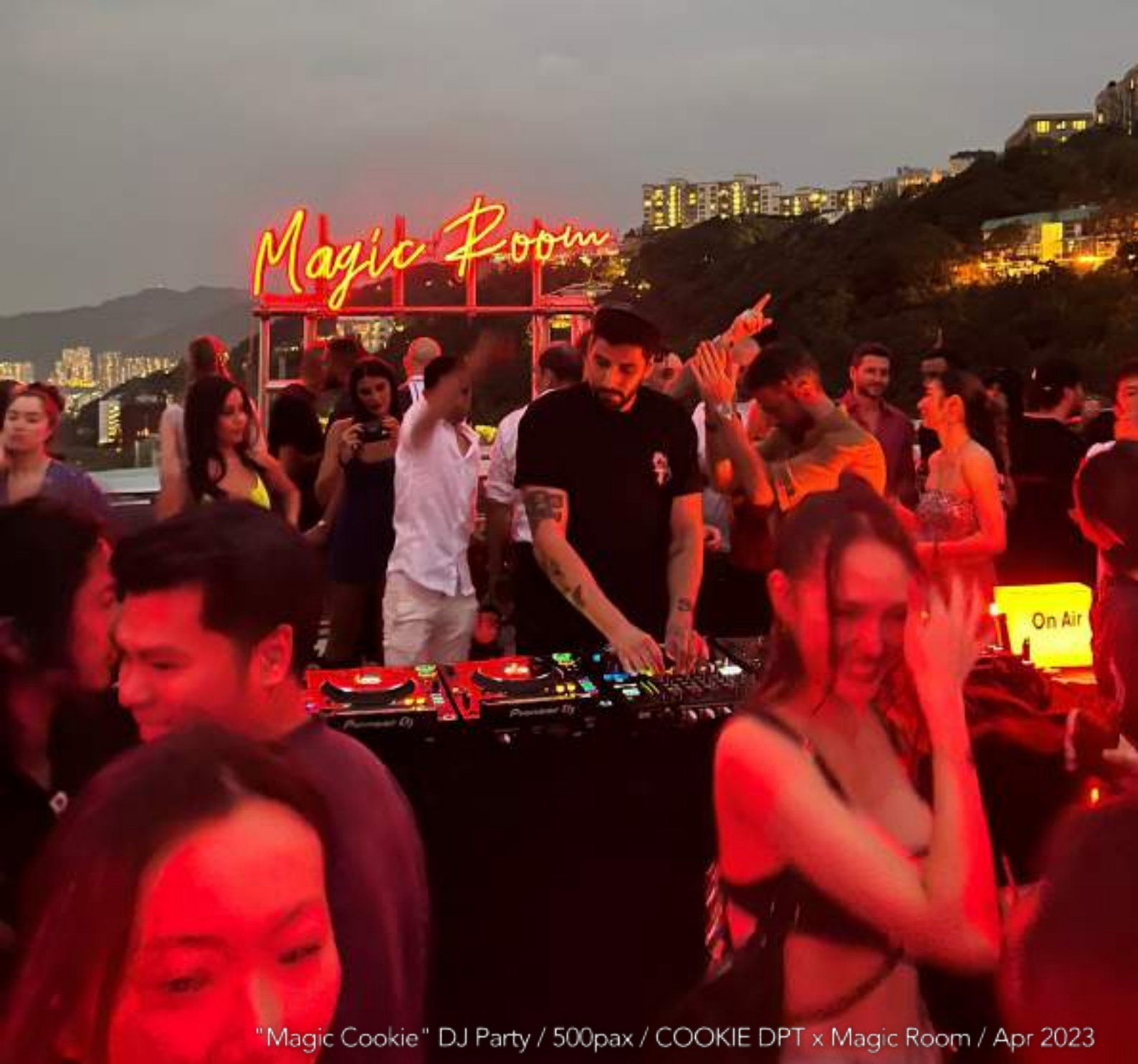
"Magic Cookie" DJ Party / 500pax / COOKIE DPT x Magic Room / Apr 2023