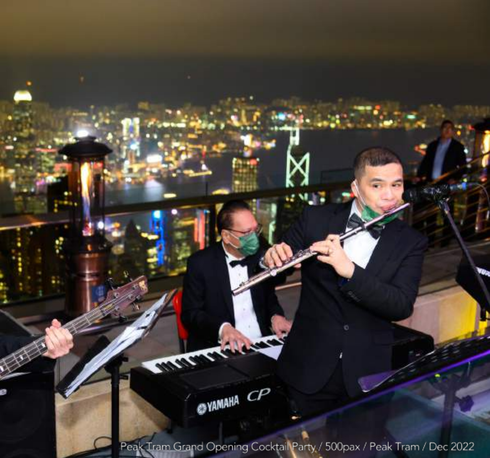
Peak Tram Grand Opening Cocktail Party / 500pax / Peak Tram / Dec 2022