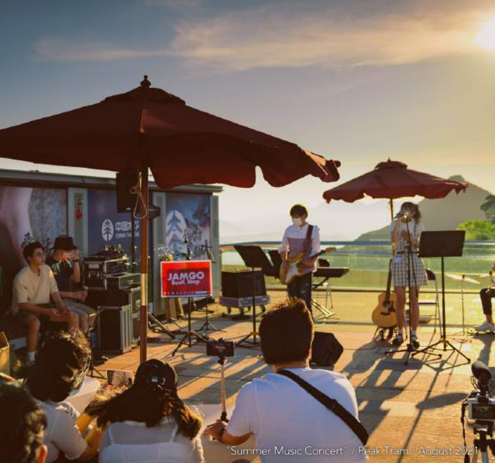
"Summer Music Concert" / Peak Tram / August 2021